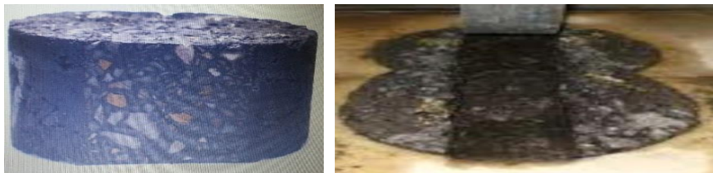
Figure 1. (a) Sample for wheel tracking test before placing (b) after placing in the wheel tracking test apparatus

All tests are made following AASHTO standards. The grade penetration test is performed according to AASHTO M-208 [14]. The entire procedure for the grade penetration test is according to AASHTO M-208, except the depth of bitumen is kept 10 mm more than the expected depth of bitumen. As per the requirements of the AASHTO M-208, the test is repeated for three samples. The consistency of bitumen is determined by using softening point of bitumen. The softening point of bitumen is carried out according to AASHTO M-81, and M-82 and tests are repeated for two specimens [15].