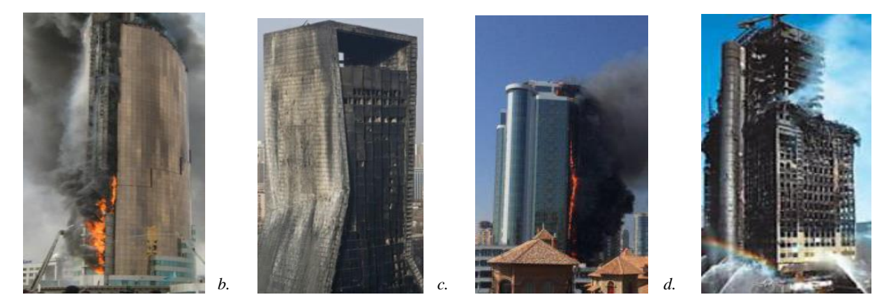
Figure 3. Pictorial view of fire on:: a. Skyscraper Transport-Tower, Astana; b. Hotel Mandarin Oriental, Beijing; c. Building in Odessa; d. Madrid building [30].