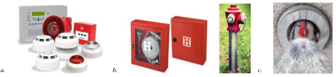
Figure 4. Pictorial view of: a. Fire detection and alarm systems; b. Internal and external (above ground) hydrants; c. Sprinkler head [35].

The American National Fire Protection Association (NFPA, 2003) has developed a framework for evaluating fire safety, so called Fire Safety Concepts Tree [36]. The leading cause of serious fatalities in fires event is smoke suffocation i.e. the number of smoke casualties ranges 80% to 90%, whereas a considerably fewer people die due to collapse of building [37]. On the contrary, all buildings must be designed in such a way as to maintain their structural integrity during the fire and thus enable safe evacuation of people and provide a certain level of protection for firefighters. Time duration before the structural collapse should be minimal of 15 minutes, for lightweight wooden/steel structures, including roofs, 1 hour for: small buildings and 3 hours: for H-R buildings [38].