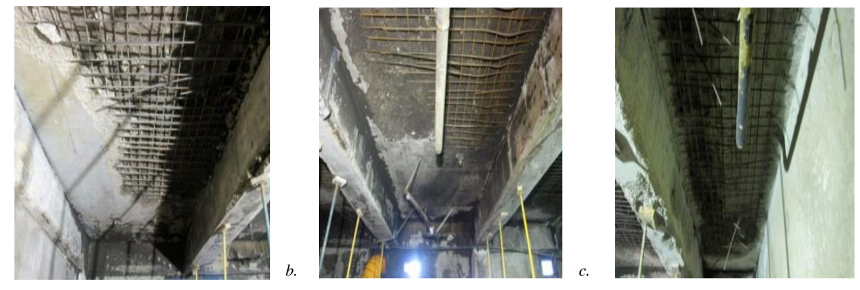
Figure 2. Destruction in slab soffit: a. Slab#1, b. Slab#2 and (c) Slab#3 [10].

Exposure to fire can cause R-C-S deterioration, even lead to the collapse of building. Depends upon the fire period and on the structural details i.e. concrete cover, R-C-S elements to be able to bear the effect of fire and stay stable afterward cool down. In the latter case, a structure cannot be bent during a fire, it can still undergo from weakening of the steel and concrete because of higher temperatures. Structural property of reinforced concrete is the flexural ductility i.e. ratio between deformations at state of ultimate and at tension steel yield [11]. Minimum duration to resist the fire in R-C-S shown in Table 1.