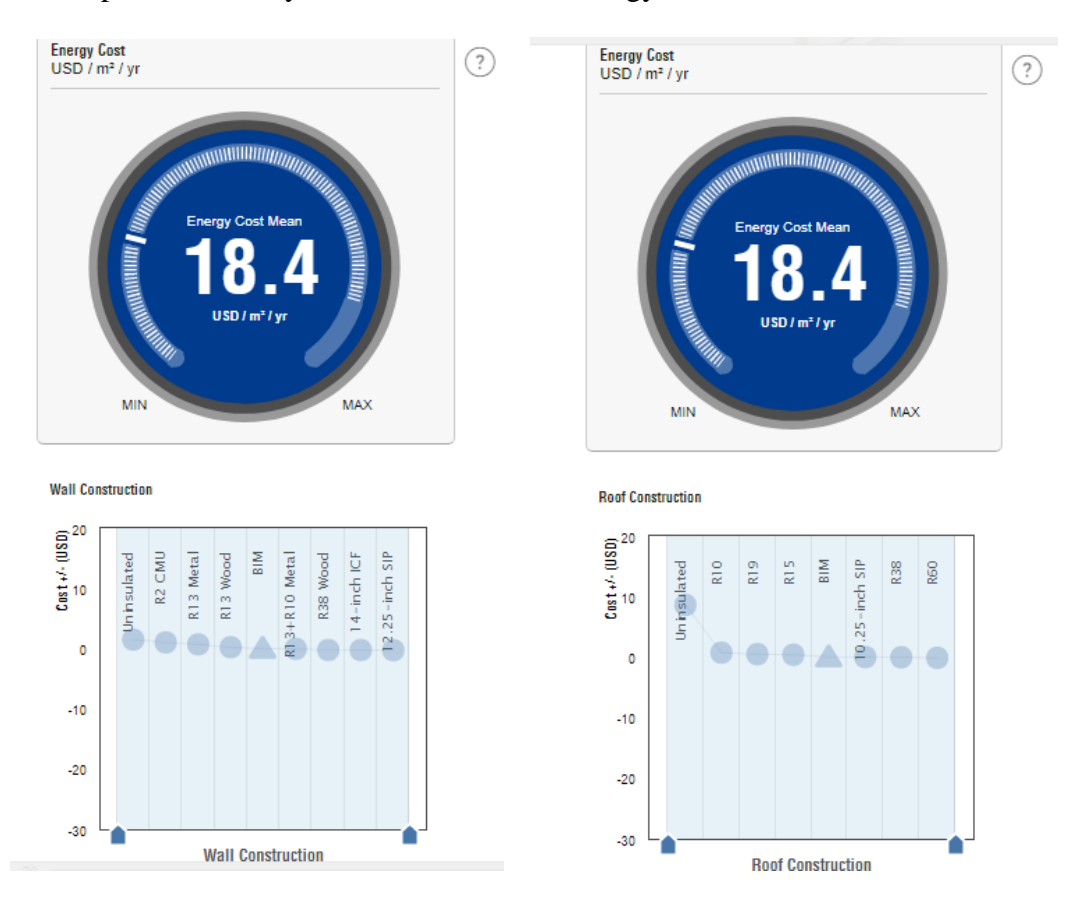
Figure 2: Autodesk Insight results for wall and roof construction